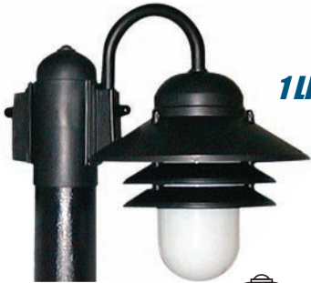
1 LIGHT NAUTICAL POST TOP