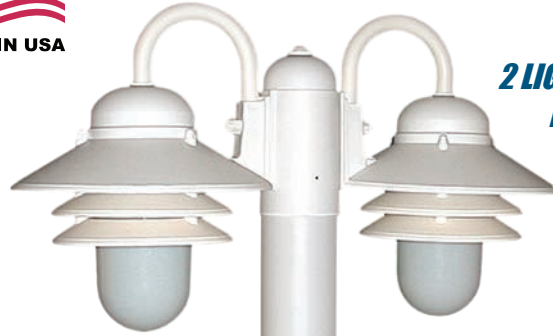
2 LIGHT NAUTICAL POST TOP