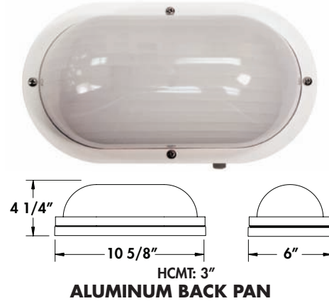
ALUMINUM BACK PAN