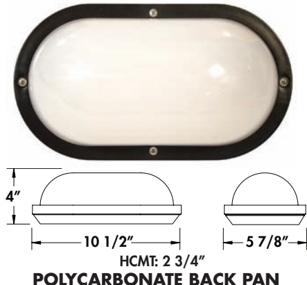
POLYCARBONATE BACK PAN